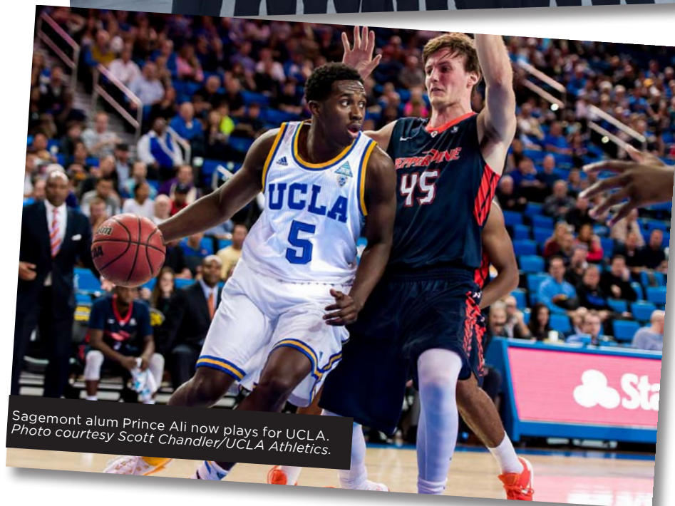
Sagemont alum Prince Ali now plays for UCLA.