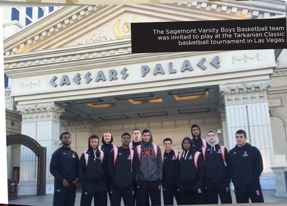
The Sagemont Varsity Boys Basketball team was invited to play at the Tarkanian Classic basketball tournament in Las Vegas.